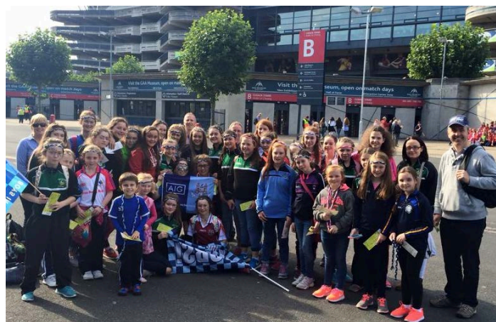
Killeavy Ladies enjoying the All-Ireland Ladies finals in Croke Park last Sunday